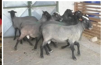
Group of selected rams 4,5 months old (litters from 4-6 lambs, weighing from 45- 54 kg)

Total weight of litter at 100 days: 125-160 kg.